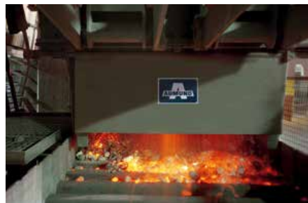
Bath material cooled down from 850 °C to 100 °C