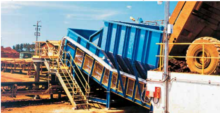
Samson® Feeder for red mud