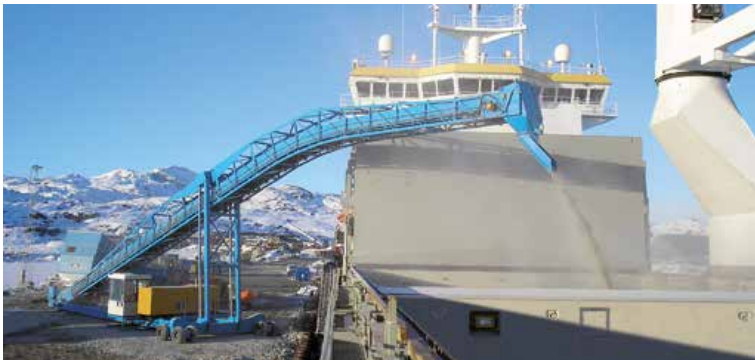
Shiploader for alumina and bauxite handling