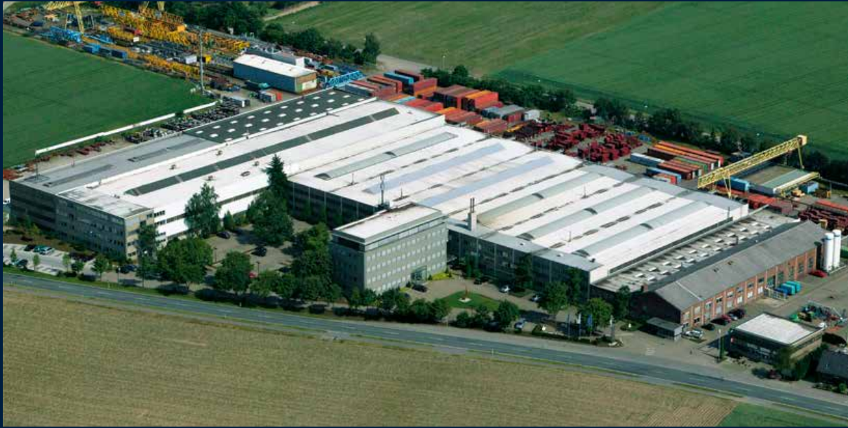
AUMUND headquarters in Rheinberg, Germany