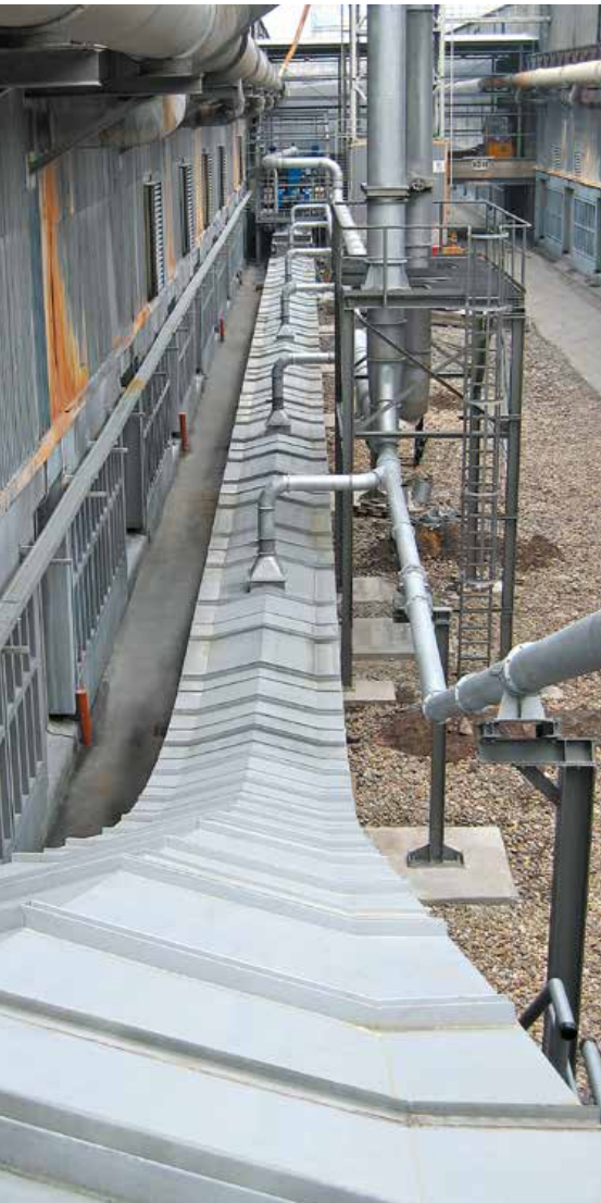
Cooling conveyor with dedusting main pipe