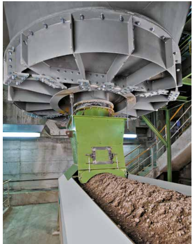
CENTREX® automated bauxite discharge