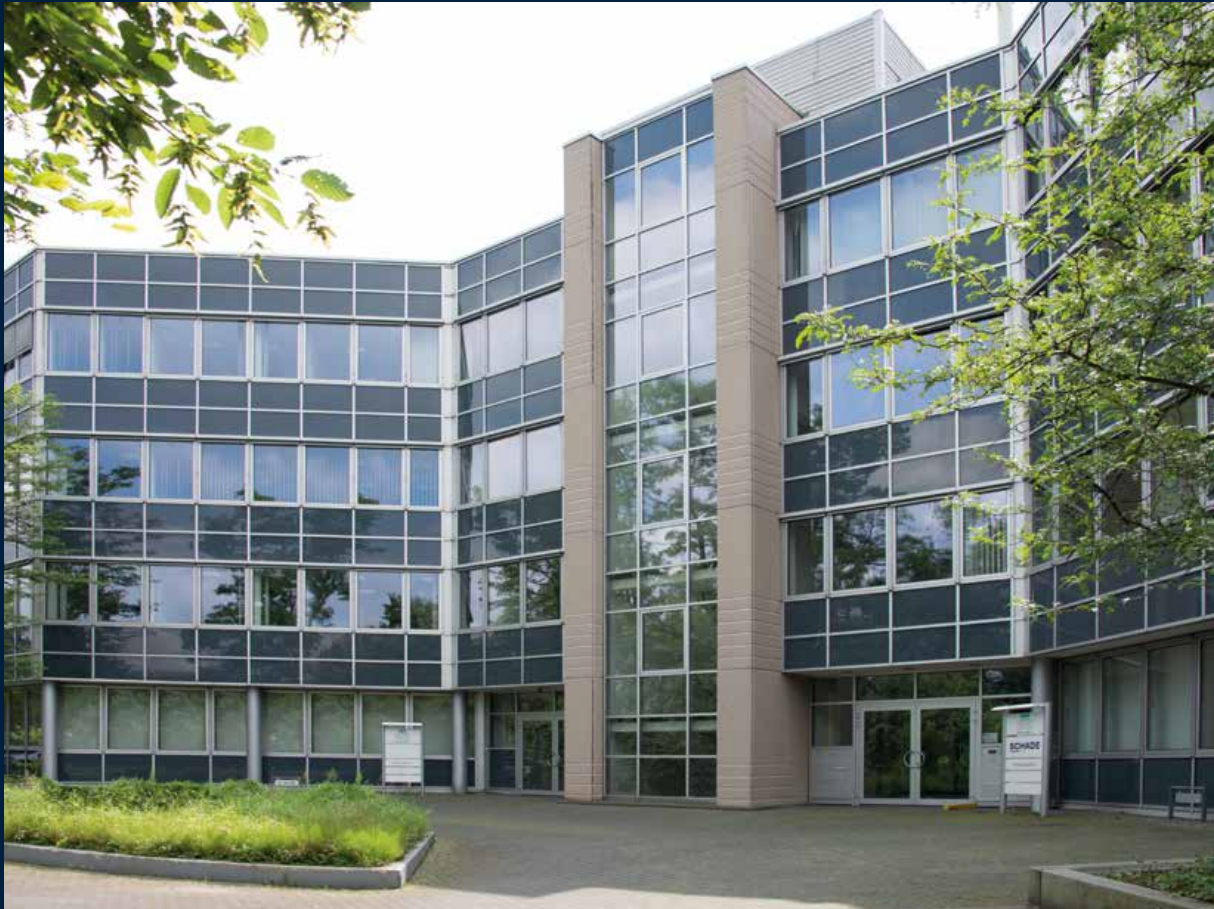
SCHADE Headquarters Gelsenkirchen, Germany